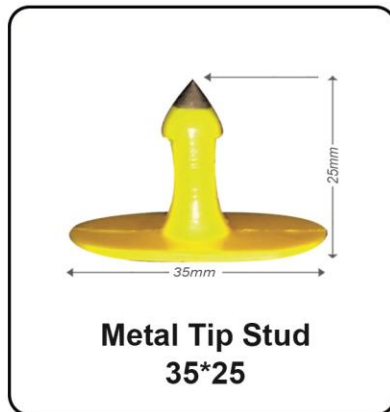
Metal Tip Stud 35*25